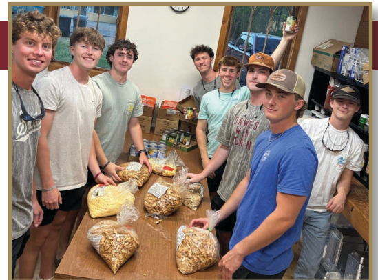
Brothers volunteer and serve the community with Second Servings on March 30.