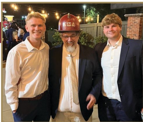
Brothers enjoy our latest alumni date party on October 24.