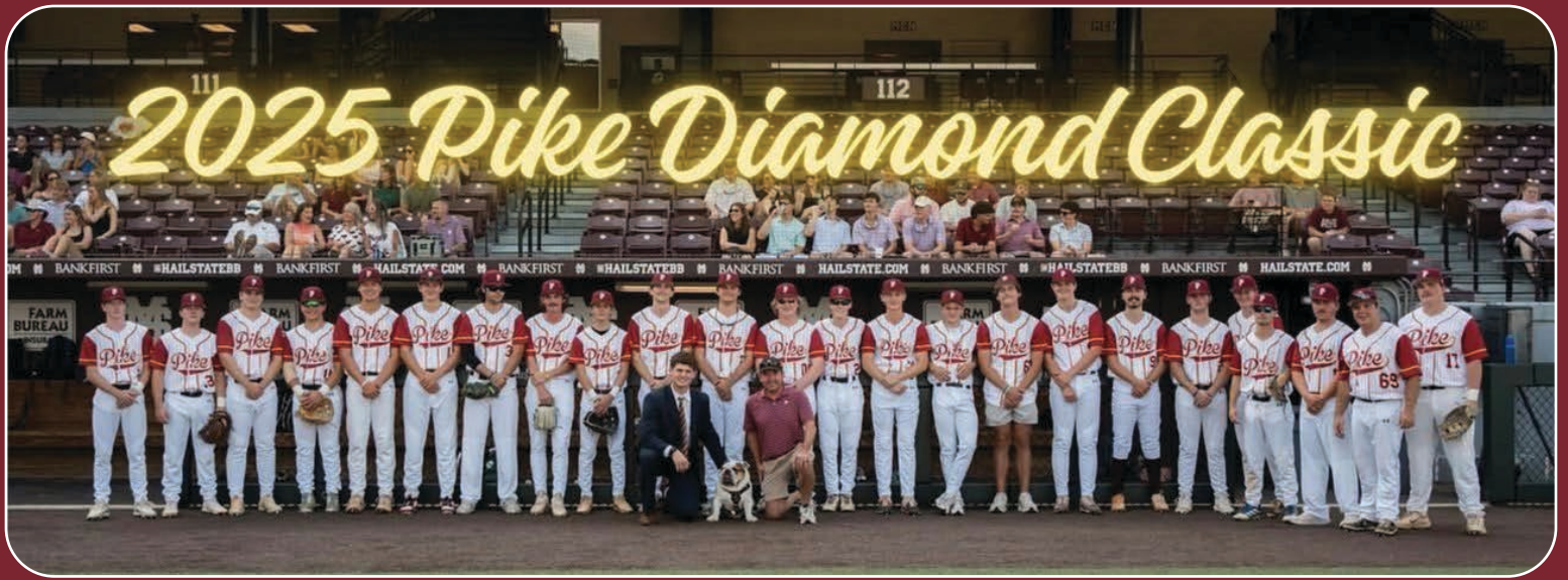
The inaugural Diamond Classic, held on September 12, was a resounding success.