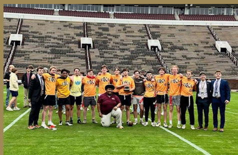
PIKE's intramural flag football team wins the Charity Bowl tournament at Davis Wade Stadium.