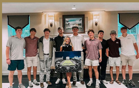
Brothers host a raffle to support the Rally Foundation, a non-profit that works to fund treatments and research for childhood cancer.