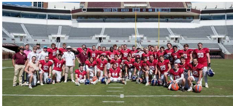
Pikes play in the 2025 Charity Bowl Classic against Kappa Sigma.