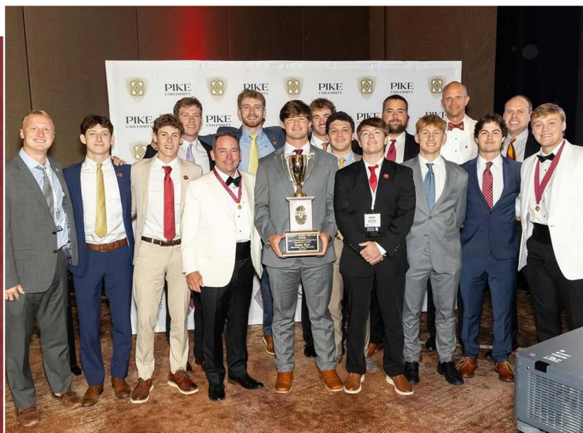
Gamma Theta accepts the Robert Adger Smythe Award for the first time since 1974.