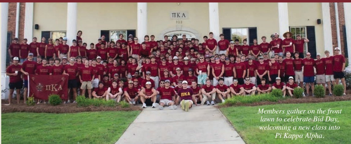
Members gather on the front lawn to celebrate Bid Day, welcoming a new class into Pi Kappa Alpha.